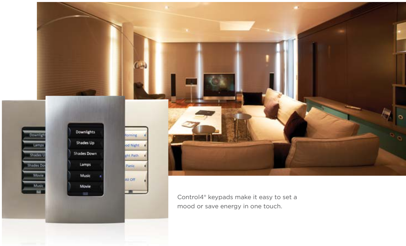
Control4® keypads make it easy to set a mood or save energy in one touch.

Combine lighting with curtain control and the whole house looks occupied, even when you're away. Or tie it into your home theater system so the drapes close automatically as the lights dim. You can control lighting scenes throughout your home from a central keypad or touch screen—no more dashing through the house to flip switches. And don't even think about construction hassles. With a Control4 system, you can turn any standard outlet into two smart outlets, ready to control just about any electrical device. It's really that easy.